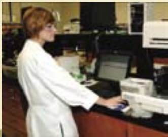
U.S. Army Research Office

TransGenRx has developed transgenic chickens capable of expressing and secreting specified proteins into the whites of eggs, allowing economical large scale production of pharmaceutical proteins such as vaccines, antibodies, and antidotes. This technology is the targeted integration of a desired gene sequence into virtually any animal, and the controlled expression of that sequence to achieve a desired outcome such as protein production and gene therapy. This may be a major breakthrough in molecular biology and recombinant DNA technology, the disciplines that make up biotech drug development. Ultimately, successful development of this technology will make it possible to save millions of lives through the production of protein therapeutics and diagnostics that were not economically feasible in the past. This technology holds the potential to lower the cost of production of protein drugs in this rapidly growing industry by 100 fold – a protein that currently costs the industry $100 can be made for $1.