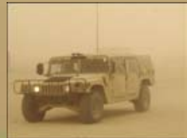
U.S. Army Research Office

Satellite communications on-the-move is a critical capability for military situational awareness and also has many commercial applications for entertainment and high-speed communications. Sophia Wireless has successfully developed the smallest sized, lightest weight, and highest performing solid state power amplifiers (SSPA) for satellite transceivers. The amplifiers use innovative and proprietary power combining circuits, hybrid RF integration, and thermal management techniques to achieve high power levels while maintaining excellent linearity and wide bandwidth. Their Ku-band SSPA operate from 12.6 to 18 GHz, about 10 times the typical SSPA bandwidth. The size, weight, and power of these new amplifiers make them particularly well suited to applications in ground mobile platforms, unmanned aerial vehicles, and other military and commercial mobile applications.