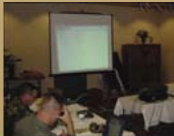
U.S. Army Research Institute for the Behavioral and Social Sciences

Knowledge Analysis Technologies developed an automated software agent to monitor, moderate, and evaluate contributions in an online collaborative environment. This novel application of Latent Semantic Analysis advances the state of the art in military leadership development by providing expert feedback to users and access to hundreds of digital books. Leaders have instant access to online critical incident resources for training and by embedding the knowledge of senior officers into the system, junior leaders can reap the benefits of direct mentoring – anytime, anywhere. The agent has been used successfully by cadets at the U.S. Air Force Academy and senior officers at the U.S. Army War College. In both cases, the use of this system led to significant improvements in training performance.