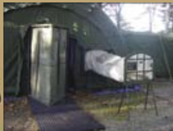
U.S. Army Natick Soldier Center

Diversified Marketing Group developed an economical and flexible closure system for the next generation of breathable and lightweight chemical protective garments, offering protection from gas, liquid, chemical biological (CB), and hazardous materials. The highly effective FLEXSEAL™ closure combines a matrix of weaving techniques, element constructions, material coatings, and unique channeled slider and seal block technologies. The closure remains airtight when bent, and air and water impermeable while sufficiently resisting toxic chemical and nerve agent simulants. No longer will closures be the weakest link in the protection of civilian and Soldier in a hostile CB environment. End-items can now be vacuum sealed and packaged without closure failure. This new technology has many military and commercial uses, including chemical protective overgarments, OSHA's Level A – D suits, CB shelters, Dry Bags, and underwater equipment.