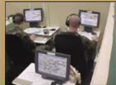
U.S. Army Armament Research, Development and Engineering Center

To assist the Future Combat Systems (FCS) Program in solving the single operator, multiple robot command and control challenge, CHI Systems developed simulation prototypes of robotic FCS weapon and sensor systems, which contain rich sets of task-based behaviors. The CHI-developed FCS Unit of Action Robotic Control behaviors allow single control of up to 200 robotic systems by assigning robotic commander behaviors to hierarchies of subordinate robots, and then managing robots by exception. Robotic commanders are able to control their subordinates, allowing the human controller to manage only a few key robotic subordinates, rather than hundreds of individual robots. The robotic control behaviors were inserted into the Armament Research, Development and Engineering Center Combat Decision Aiding System to perform testing of FCS effects-based operations by robotic systems in simulation environments. The behaviors allowed hundreds of simulated robotic weapon systems to operate with limited human intervention.