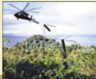
U.S. Army Communications—Electronics Research, Development and Engineering Center

Progeny Systems Corporation has developed the Aerial Canopy MASINT Sensor System (ACMS) — an air deployable remote monitoring system for the Soldier that allows significantly better intelligence gathering and information transmission in any environment. ACMS enhances situational awareness and precision targeting without risk of personnel loss. Fundamental to ACMS is a forward area dispersed array of sensors and communications relays that have already demonstrated successful, remote deployment from both a helicopter and a Tactical Unmanned Aerial Vehicle. The work being conducted by Progeny provides a cost-effective, high performance approach to ACMS by designing a configurable payload capability that features flexibility of signal processing capabilities, sensor packages, deployment options, and RF communication links. ACMS can effectively be used for early warning, area denial, facilities protection, Combat Search and Rescue, Counterterrorism, Border Patrol, and Counter Drug Operations.